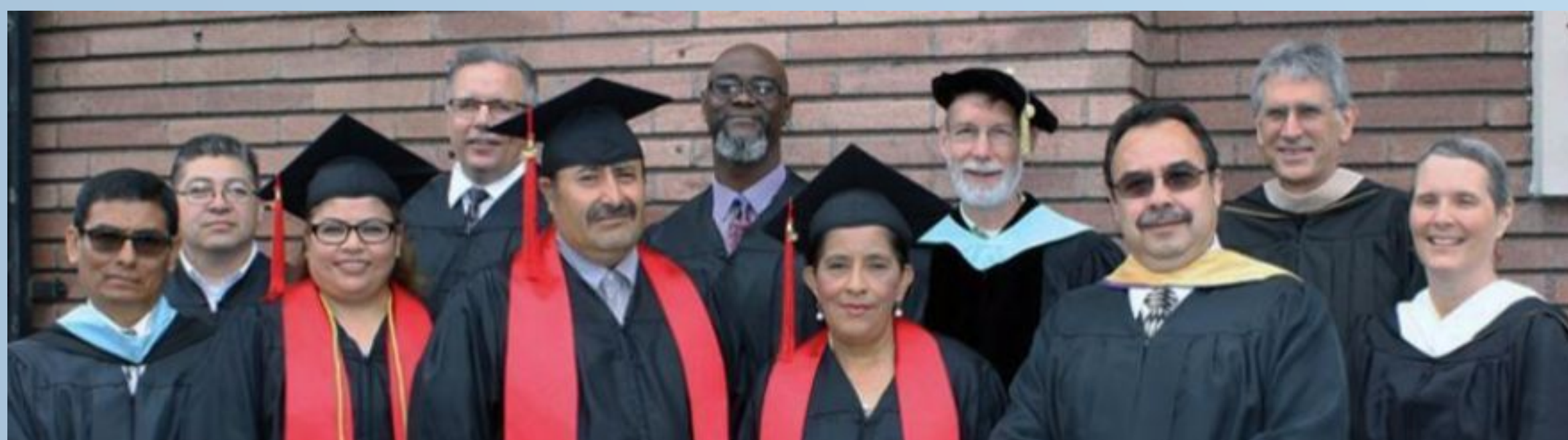
2017 Graduates of The Urban Ministry Institute in Los Angeles, CA.