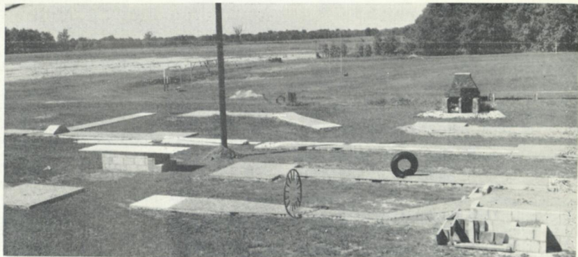
The newly completed miniature golf course is the latest addition to the Student Project. Other new facilities and improvements include two new shuffleboard courts and two new permanent basketball goals. The area around the project has been graded and grass planted. Light poles and power lines have been installed on half the tennis courts.