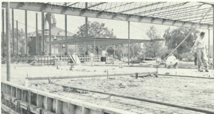
Progress on the new dormitory and food center is shown in the latest photo, taken September 13. Construction is continuing on schedule.