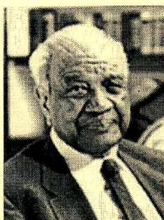
Rev. Gardner C. Taylor Chapel, January 15

Because God has reconciled the world to Himself in Christ, we, like Paul, will promote that same message of reconciliation: If anyone is in Christ, he is a new creature. The old has passed away, the new has come. As those who have been made a new creation in Christ, we will observe Martin Luther King, Jr. Day by celebrating our reconciliation with God and one another in Christ and calling others to be reconciled with God and one another in Christ. In Jesus and Him alone is true and lasting reconciliation.