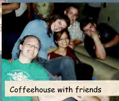
Coffeehouse with friends