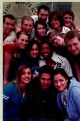
On the Cover: Students enjoy life at Taylor Fort Wayne .