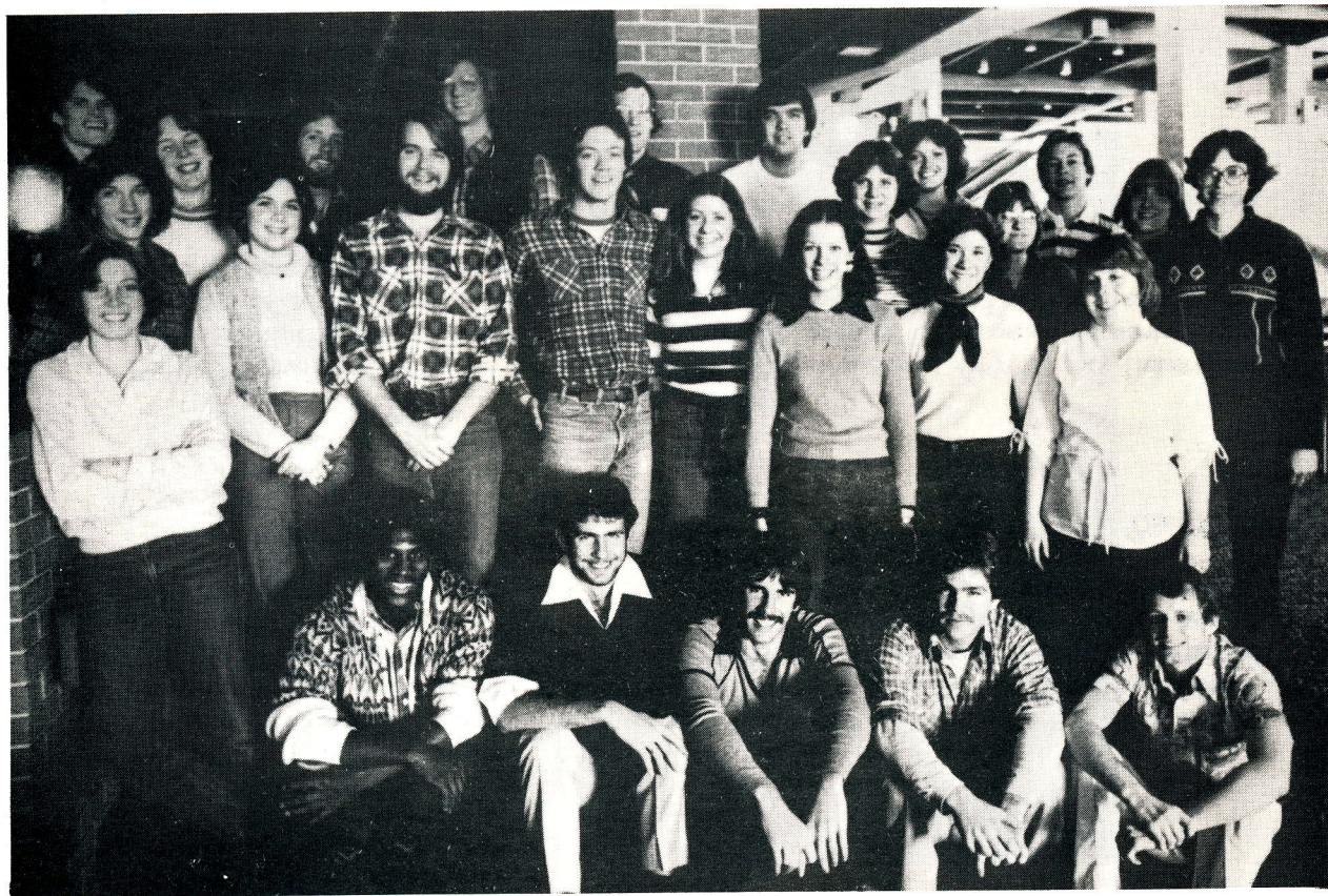
1979 YOUTH CONFERENCE CABINET