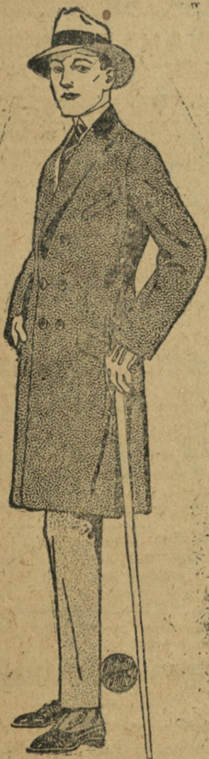
We Sell Ralston Shoes

Missess, Boys and Men's night shirts. O. C. BOWEN & CO.