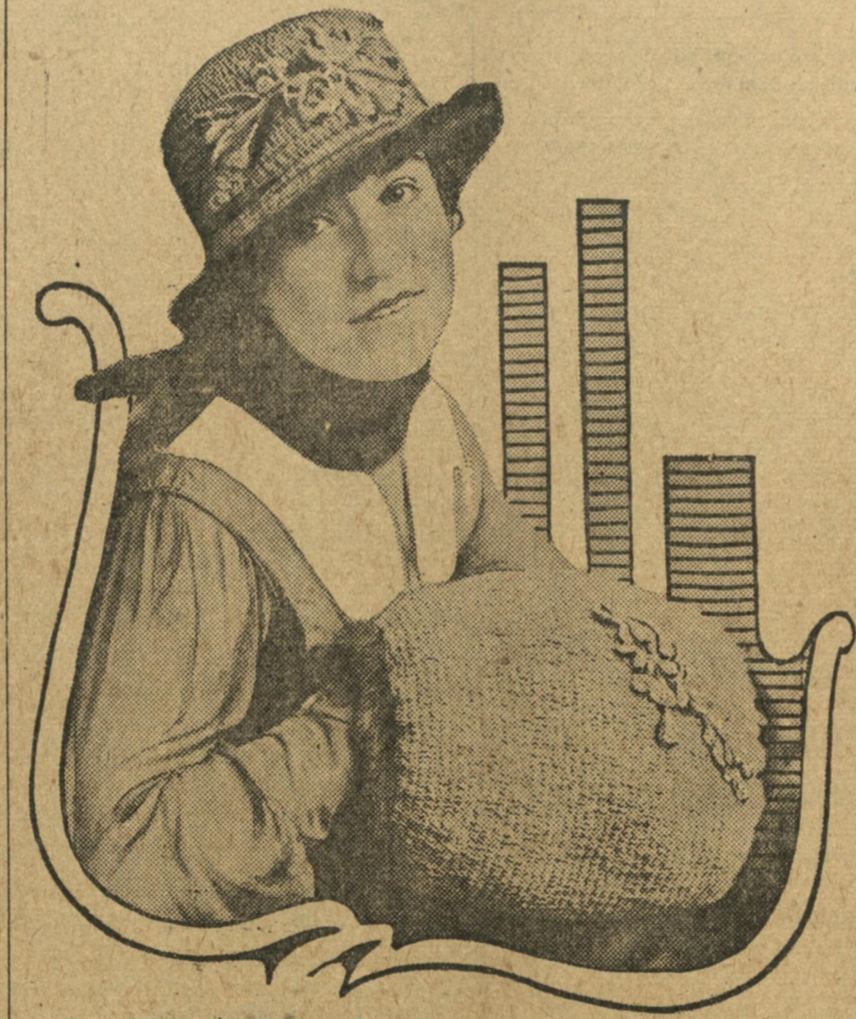
Something New in Matched Sets.

Perhaps you are looking for a coat which, you will enjoy wearing in the evening and expect to press into service for afternoon occasions. In this case you might turn attention to velvet with the assurance that your judgment is directed to the right quarter. Velvet stands midway between cloth and fur, having a restricted following of its own. At its best it is fur-trimmed or made so that it can be conveniently worn with a fur set. It almost goes without saying that "velvet" includes velveteen and that most of the coats made of either material are intended for evening wear. They are sumptuous affairs, in new or familiar colors, including robin's-egg blue, moss and light greens, coffee color, chartreuse, sapphire, etc. Nearly all are trimmed with furs in the usual colors, or undyed, and white fox poses on coats in the lighter tones. For those who like eccentricities there are furs dyed in unusual colors. A coat of velvet, trimmed with skunk