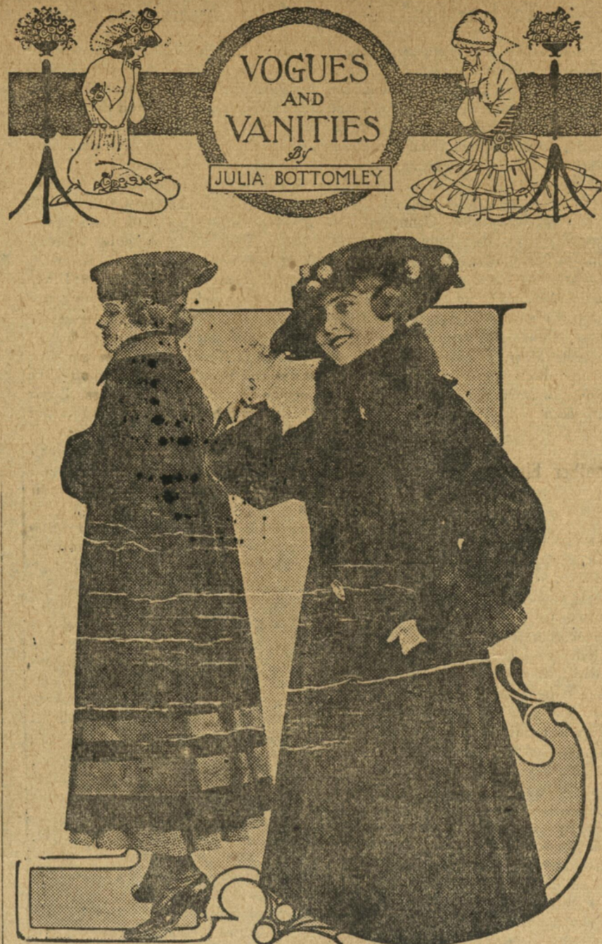
Two of the New Long Coats.

Perhaps you are looking for a coat which, you will enjoy wearing in the evening and expect to press into service for afternoon occasions. In this case you might turn attention to velvet with the assurance that your judgment is directed to the right quarter. Velvet stands midway between cloth and fur, having a restricted following of its own. At its best it is fur-trimmed or made so that it can be conveniently worn with a fur set. It almost goes without saying that "velvet" includes velveteen and that most of the coats made of either material are intended for evening wear. They are sumptuous affairs, in new or familiar colors, including robin's-egg blue, moss and light greens, coffee color, chartreuse, sapphire, etc. Nearly all are trimmed with furs in the usual colors, or undyed, and white fox poses on coats in the lighter tones. For those who like eccentricities there are furs dyed in unusual colors. A coat of velvet, trimmed with skunk