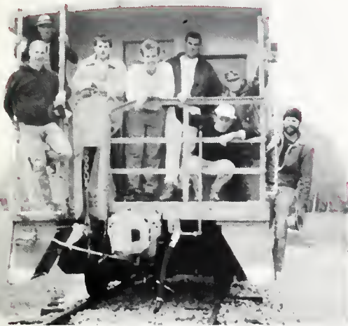
The Summit Expedition group pauses for a picture outside the caboose where they spent one night.