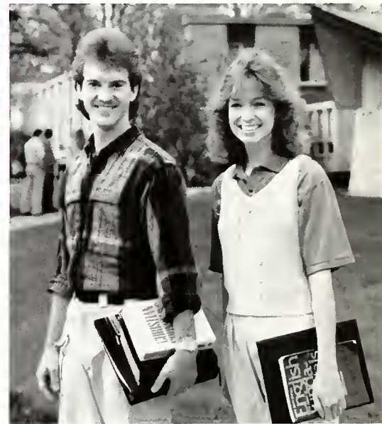
Summit's student body . . . diverse, high sense of unity, strong loyalty.

7. Student Body. The student body is diverse and exhibits a high sense of unity and strong loyalty to the institution.