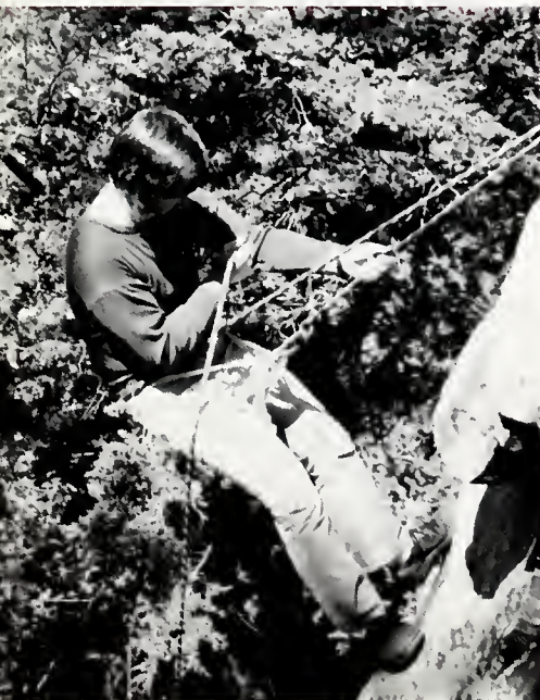
Rappelling was one of the many highlights of the Summit Expedition