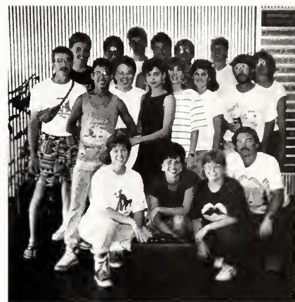
The Semester Abroad group stopped to pose for a picture as they waited to board yet another plane.

I learned the faithfulness of God in a special way. I learned of His unfailing love and promise to always care for me.