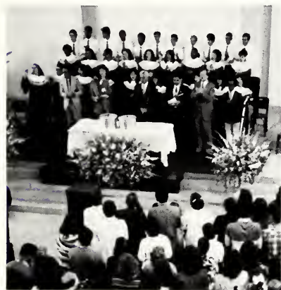
Fort Wayne Bible College students participated in the services and outreach opportunities at Peniel Church in Belo Horizonte.

very deep friendships. The "good-byes" were tearful and painful for both the FWBC students and the Brazilian hosts. It was exciting for the students to participate in the services and outreach opportunities at Peniel Church in Belo Horizonte. This church, which numbers well over a thousand, is a