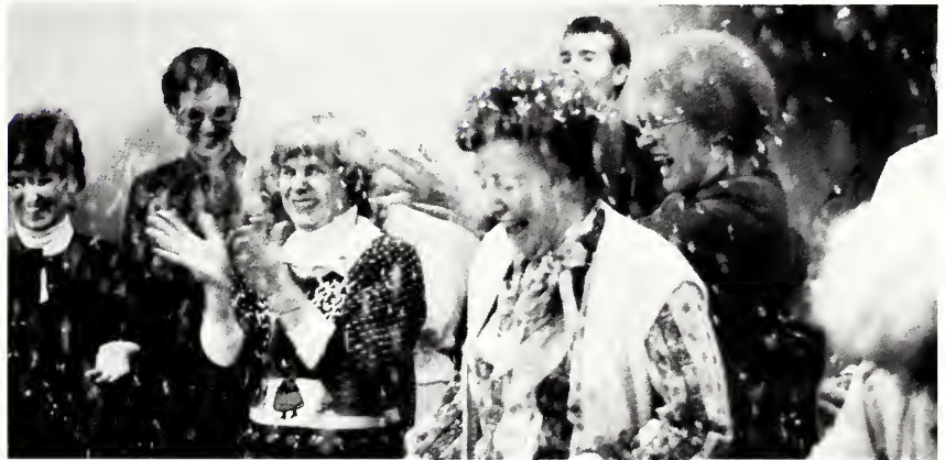
Confetti rains as volunteers celebrate surpassing the $400,000 Operating Budget goal.

WBCL has come a long way since its two-room beginning thirteen years ago. The station is in its second year in its new 6,200 square foot facility. The new facility and faithful stewardship of listeners have allowed WBCL to add much needed staff and to increase the development of production and programming.