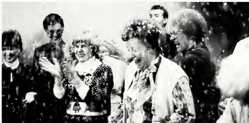
Confetti rains as volunteers celebrate surpassing the $400,000 Operating Budget goal.

WBCL has come a long way since its two-room beginning thirteen years ago. The station is in its second year in its new 6,200 square foot facility. The new facility and faithful stewardship of listeners have allowed WBCL to add much needed staff and to increase the development of production and programming.