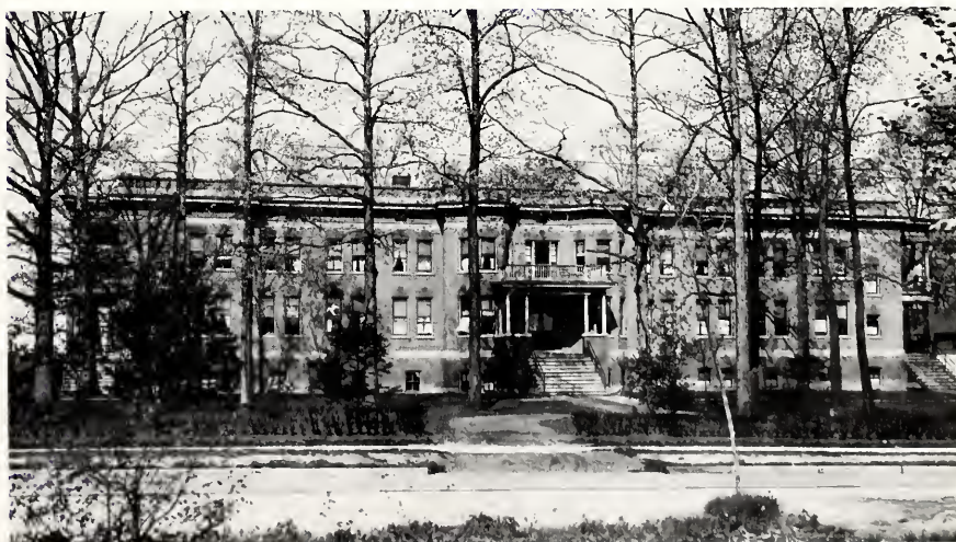
The first FWBC constructed building was Schultz Hall.