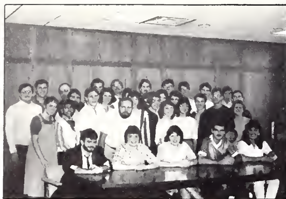
1985-86 FWBC Scholarship Recipients