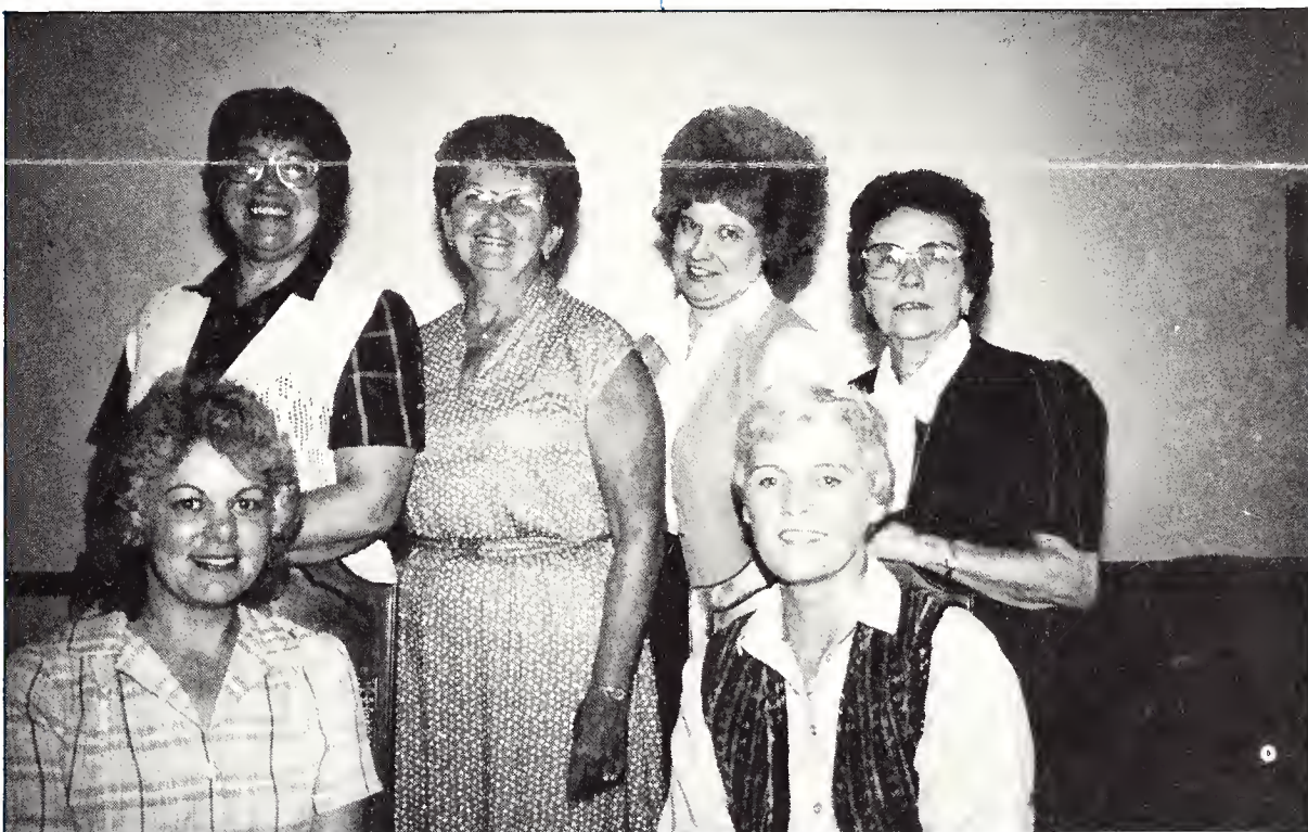
1984-85 Friend of FWBC officers

Decide today to take part by filling out the coupon on this page and mailing it soon! Your participation will help expand the ministry of this vital organization.