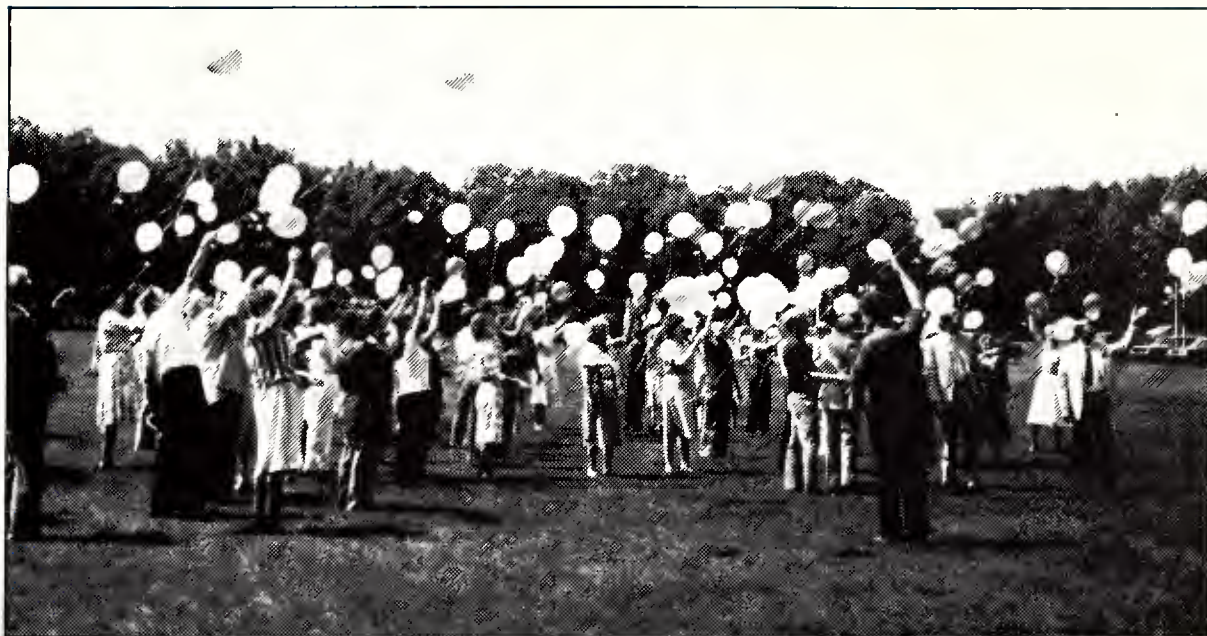
FWBC faculty, staff, and students release victory balloons following the announcement of our official accreditation.