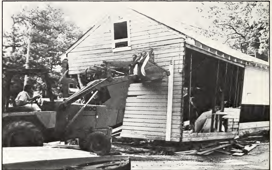
Demolition of the old Physical Plant took place June 1 to make room for the new structure.

The dream of a new maintenance facility on the campus of Fort Wayne Bible College is now a reality! After several years of careful planning, the governing board authorized construction of a new physical plant building at its spring meeting.