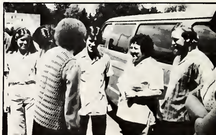
HIS Company leaves for summer tour of 70 performances, in churches and camps.

*Indicates North Central Christian Athletic Conference Contest