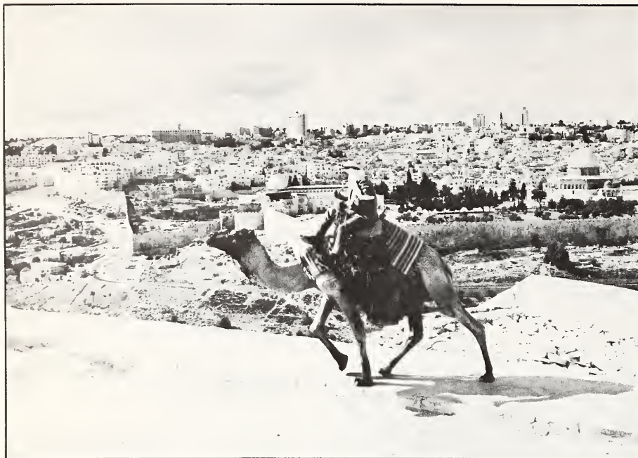
A camel's eye view of Jerusalem from the summit of the Mount of Olives