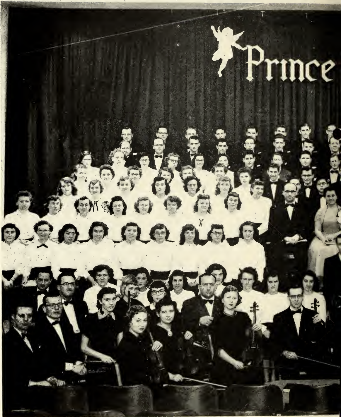
The 1952 Fort Wayne Bible College Messiah Chorus and Orchestra performing on the college campus on December 14, with I