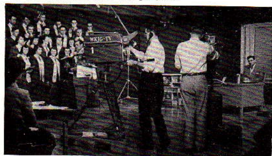
The group which presented a Lenten telecast in the studios of station WKJG-TV recently is shown above rehearsing for the program shortly before air time.