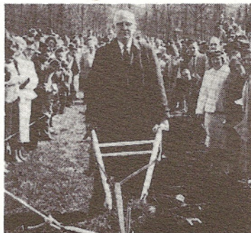
Pres. Gerig at Ground Breaking