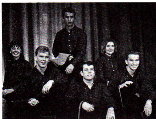
Cast from "Christ in Concrete City"