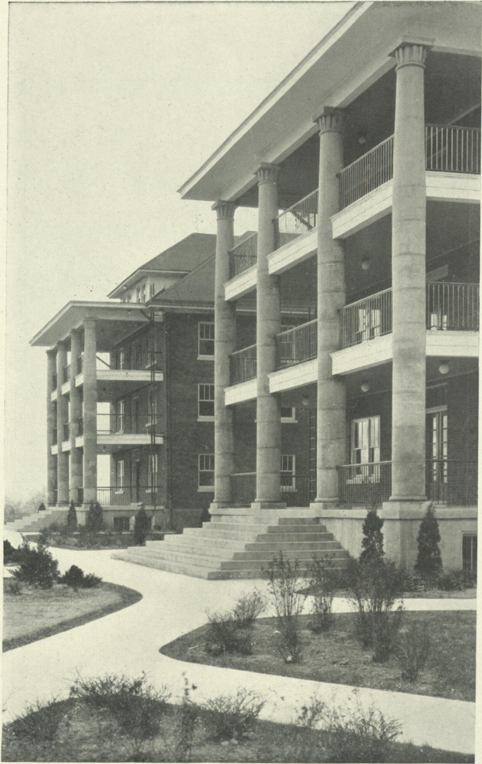
East Porches of Stanley Magee and Wisconsin Halls for Women