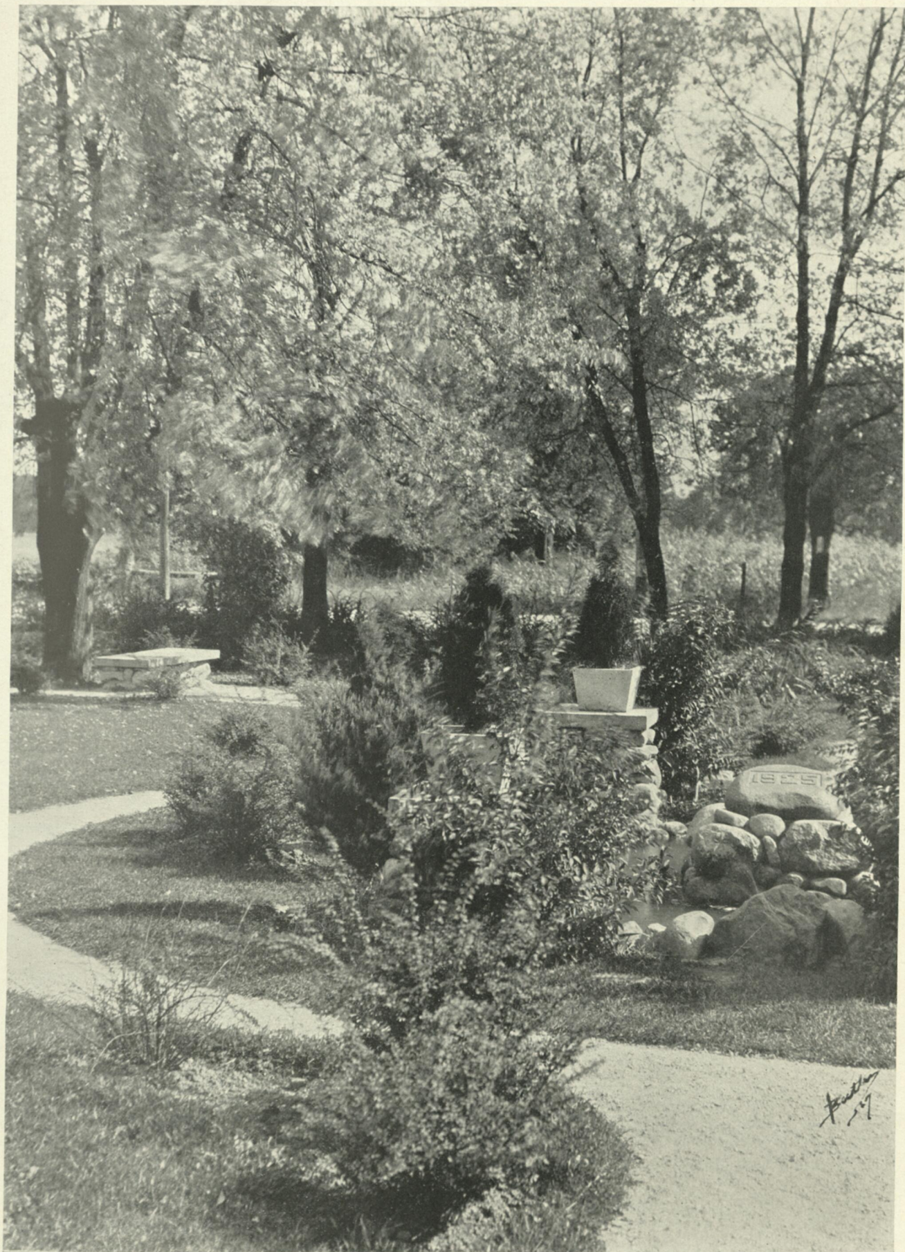
The North-East corner of the Campus.