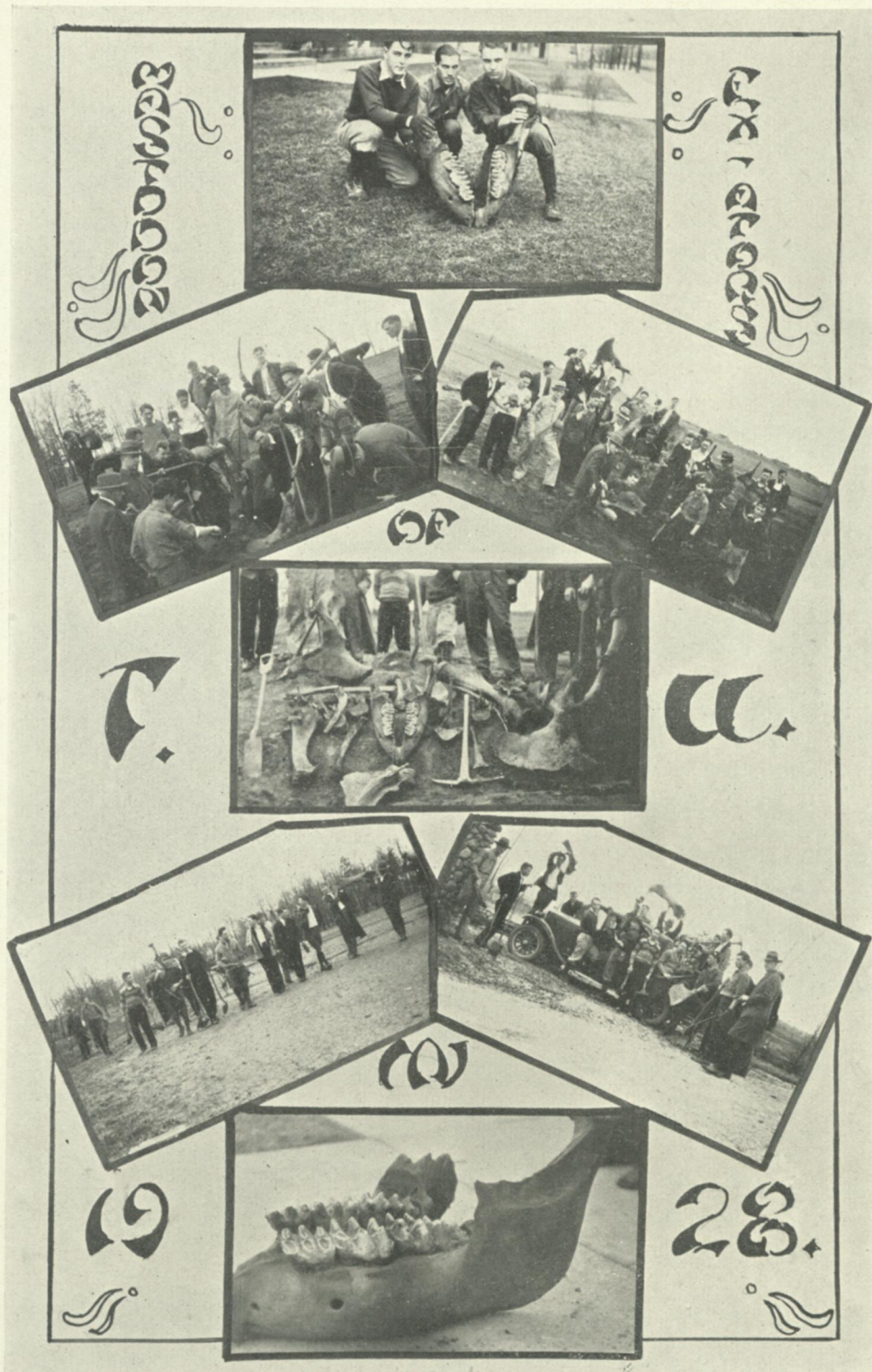
Views of pre-historic mastodon recently unearthed by Taylor University Department of Science.