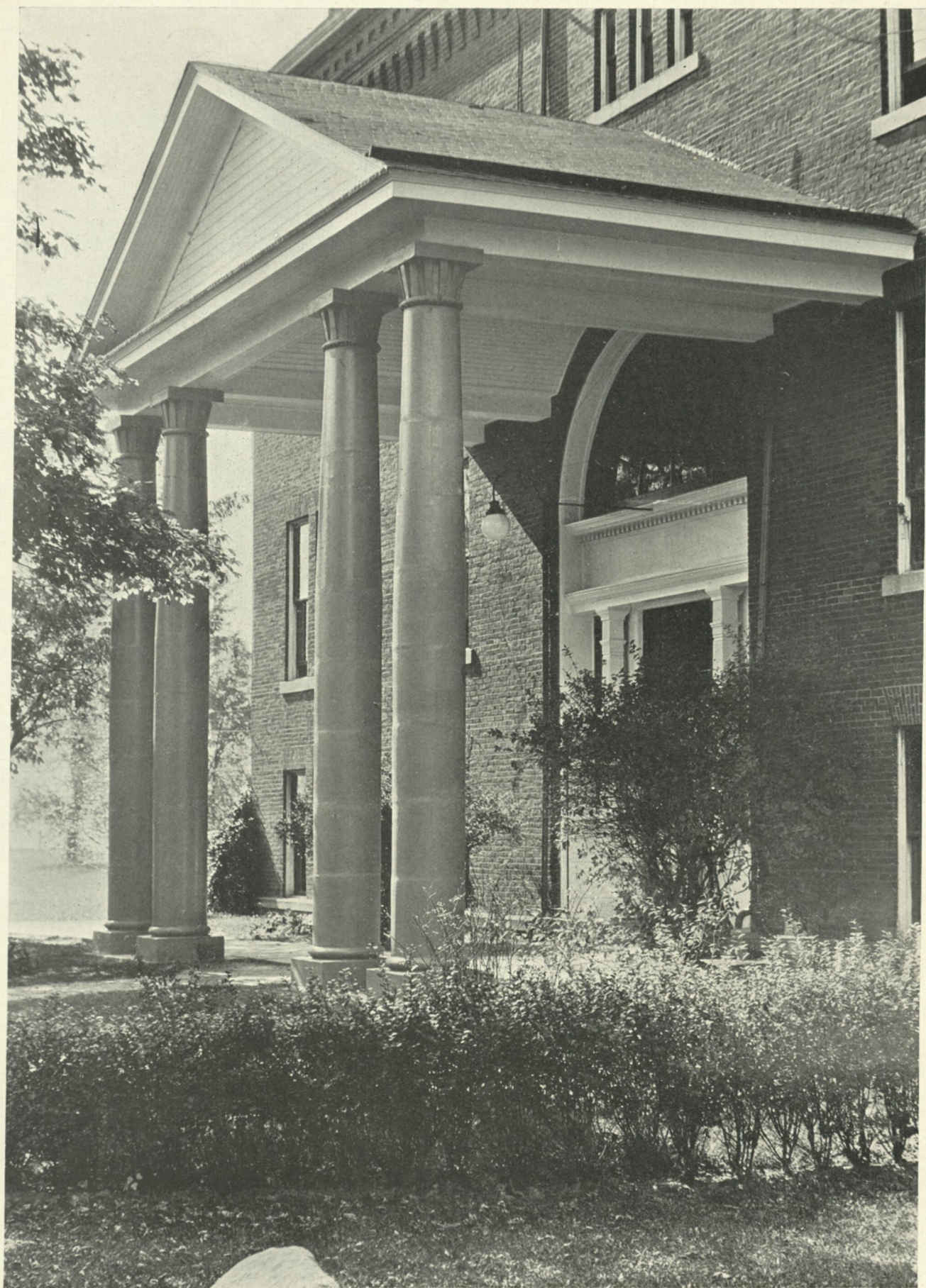
Entrance to Administrative Offices and Class Rooms.