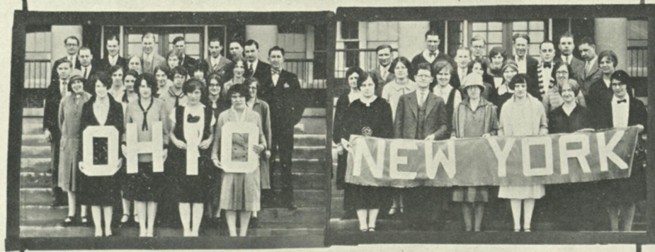
A few of the States represented in the Student Body.