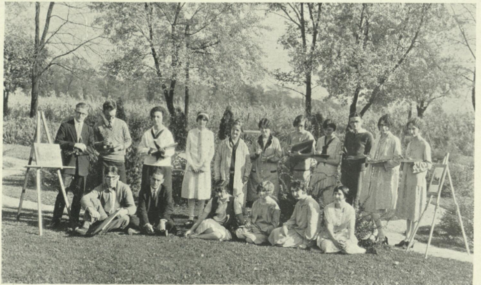
An Art Class in the Sunken Garden