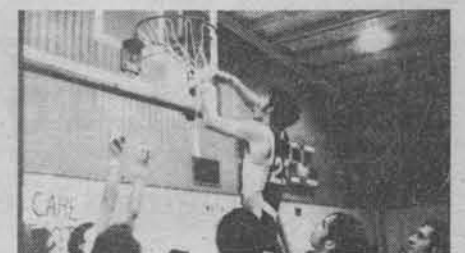
After winning the conference championship the team cut down the nets.