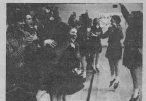
Cheerleaders yell, scream, jump, and shed tears of joy, as they realize at last, Fort Wayne Bible College is number one.