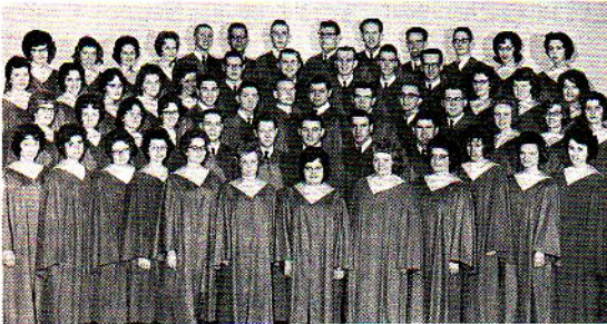
The Fort Wayne Bible College Chorale

The final program of this series will include organ meditations by F.W.B.C. music students and faculty members. This will be presented at 3:30 p.m., Sunday, May 17.