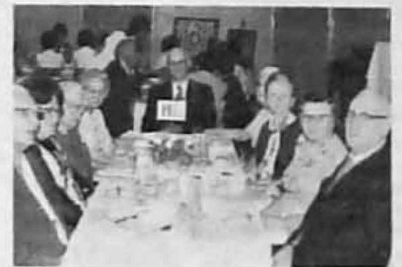
The Class of 1922 observing their 50th year since graduating.