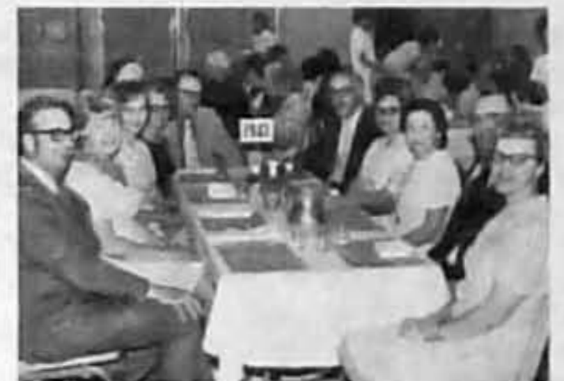
The Class of 1947 observing their 25th year since graduating.