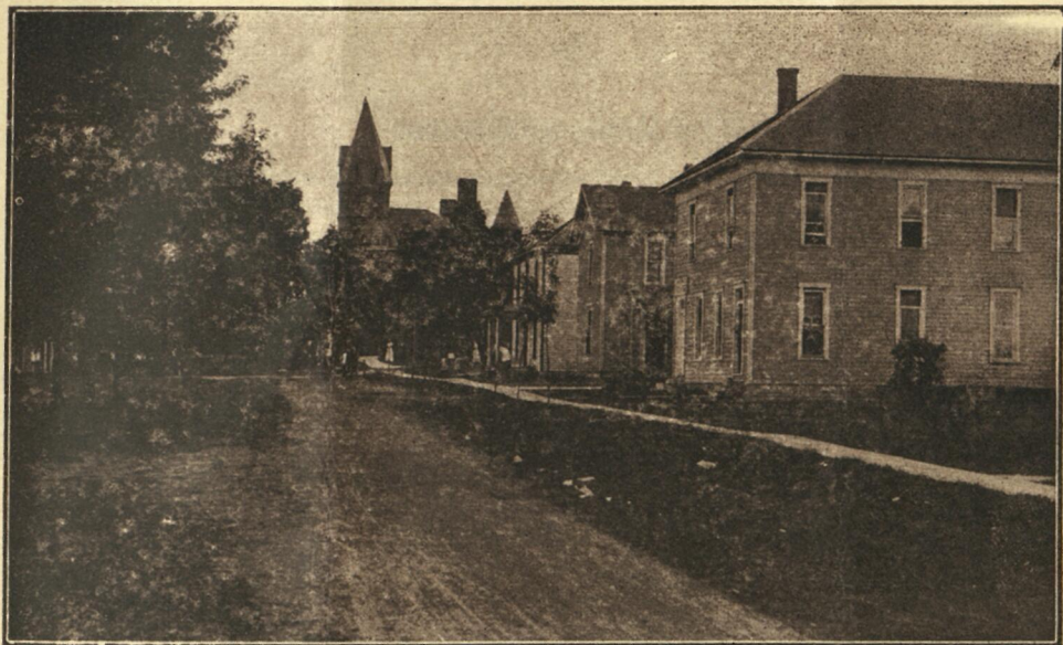
College Ave. (looking South), Taylor University, Upland, Indiana