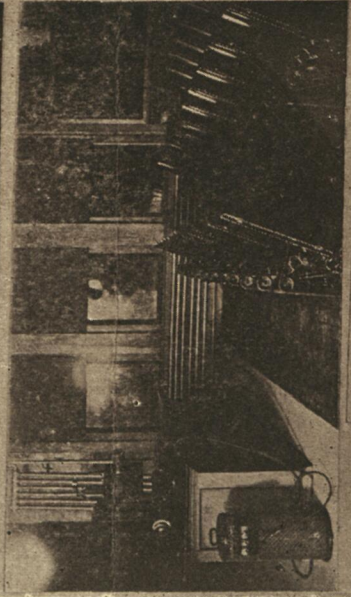
LIBRARY ORATORY ROOM SCIENCE LECTURE ROOM.