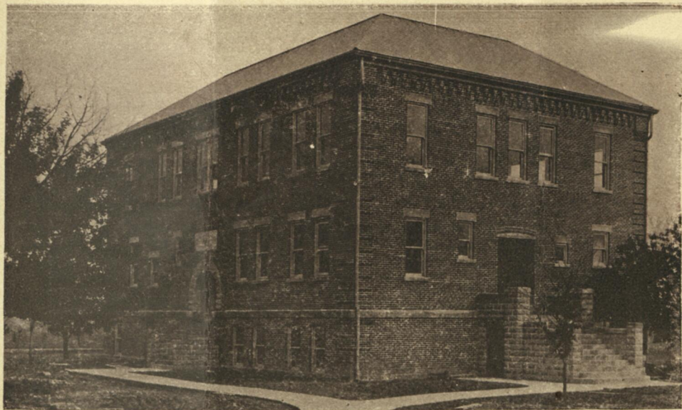
The New Music Hall, Taylor University