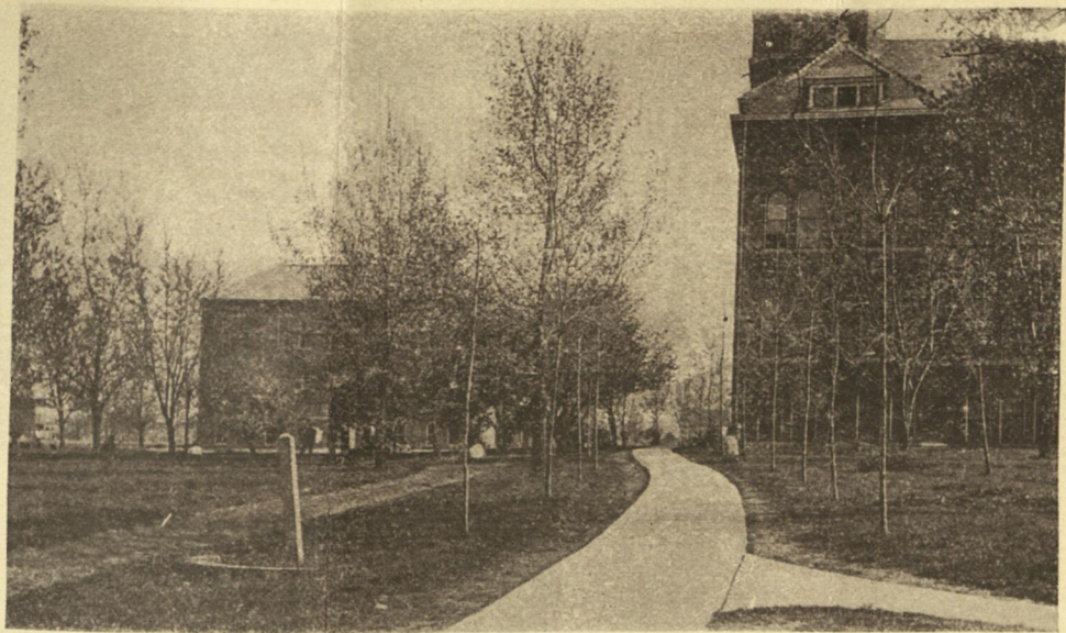
Part of Campus