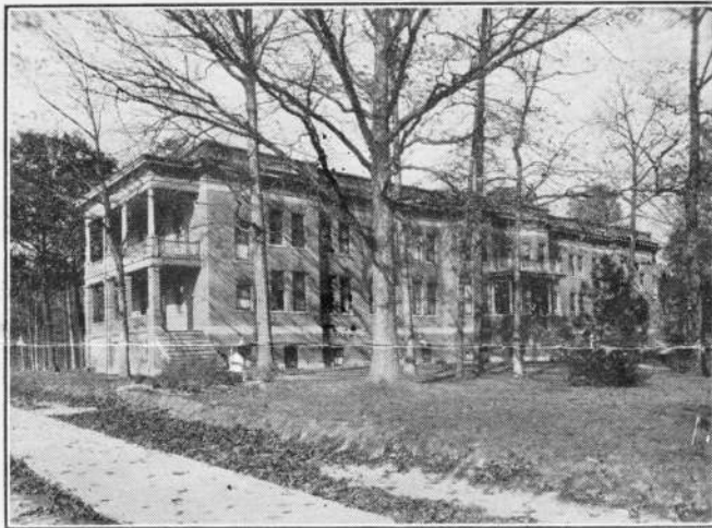
THE FORT WAYNE BIBLE TRAINING SCHOOL Fort Wayne, Indiana