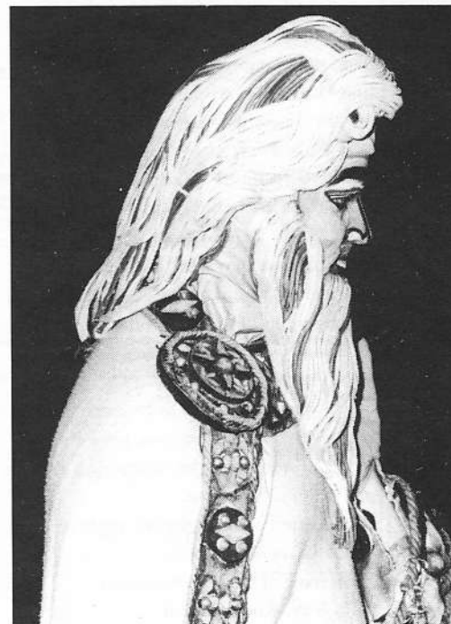
Looking as much like statues as like humans, two of the St. Paul's Romans. In an afternoon presentation, the tradition of nursery rhymes, for school children.

Today this process of developing mature Christians who are equipped for ministry is continuing with the same kind of dedication which has characterized College personnel over the years. We believe this is a ministry which is essential to the ongoing life of the church, and we believe you will agree with us when we say, "It's worth it!"