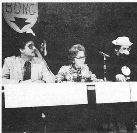
ABOVE: The extinguished panel of judges (?) give close attention to one of the carefully selected Bong Show acts.

Also, in fairness, we must point out that the intent of the entire setup was to provide light entertainment through a spoof of TV's popular "Gong Show". And the effort succeeded admirably. The "Bong Show" might not have to be cancelled after its first appearance after all!