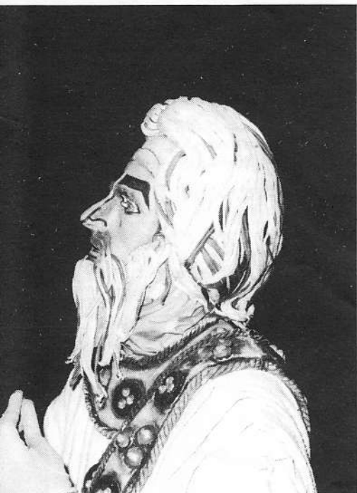
Members of the Everyman Players bring to life the story of the apostle Paul in their dramatic production performed "Hey Diddle Diddle," a dramatic produc-